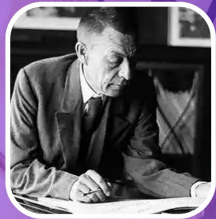
Sergei Rachmaninov (1873-1943)

Sunday 4th June, 2pm St Peter's Cathedral