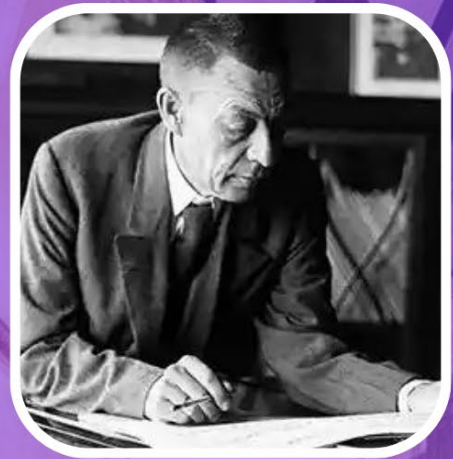
Sergei Rachmaninov (1873-1943)

Sunday 4th June, 2pm St Peter's Cathedral