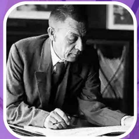
Sergei Rachmaninov (1873-1943)

Sunday 4th June, 2pm St Peter's Cathedral