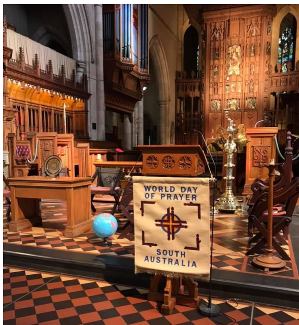
St Peter's Cathedral hosted the annual World Day of Prayer on 1 March. The service for this year, devised by women in Slovenia, was used throughout the world on this day – a moving expression of international ecumenism and co-operation.

Why "Vestry" meeting? In days gone by meetings were held in the vestry, or sacristy, of a church – possibly the only meeting space available. The name of the meeting space transferred to the actual meeting and the decision-making body – no matter the venue. For a very long time the Vestry, as the only local body council, had considerable power and say over how village life was run and funds spent. Today jurisdiction is more limited to the life of a church parish.