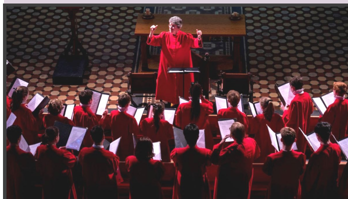
FESTIVAL 150 FREE CHORAL CONCERT St Nicolas Cantata Benjamin Britten Sunday June 9, 6pm https://www.trybooking.com/BATZB

Webpage: http://www.stpeters-cathedral.org.au/ Facebook: St Peter's Cathedral, Adelaide Office: 82674551