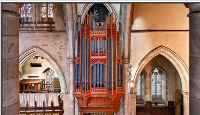
THOMAS TROTTER'S FESTIVAL 150 ORGAN RECITAL August 30, 2019 Book your ticket today at https://www.trybooking.com/BALVH