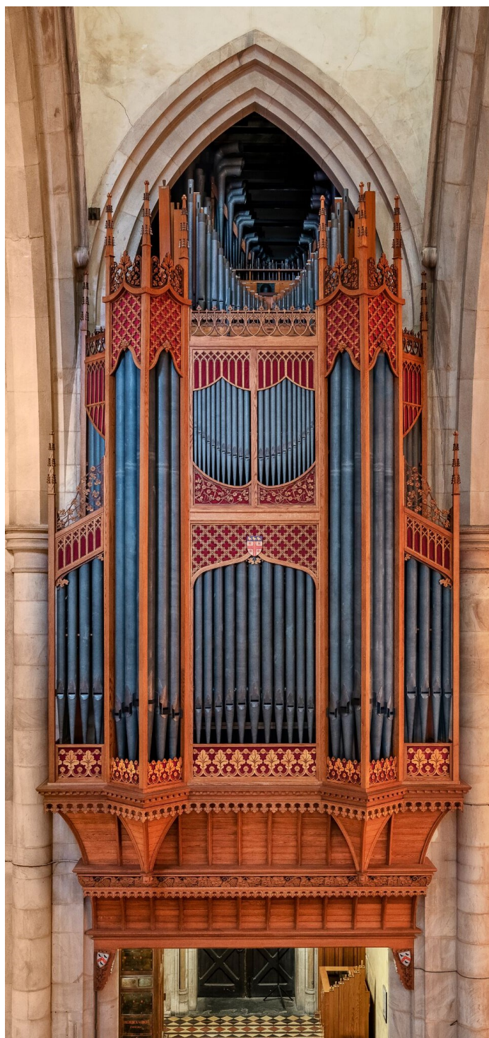
Resplendent in new casework, the sounding notes of the Cathedral Organ brought tears to many an eye at the "First Chords" service on 2 December.