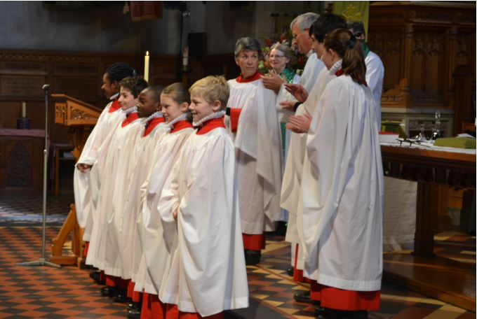
After months of training, 5 young singers earned their surpluses as fully fledged choristers. The next “crop” is already waiting in the wings.

During Evensong on Wednesday 19 October representatives from the 3 founding churches of the Magdalene Centre (Cathedral, St Mary Magdalene and St John’s), and AnglicareSA, signed a covenant agreement for a further two years of co-operation in helping the poor and vulnerable of Adelaide. One of the Cathedral’s contributions is through generous contributions to a weekly food basket, taken to the altar during the offertory every Sunday morning.