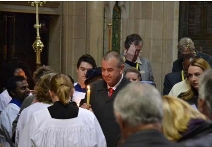
Baptised and Confirmed during September:

God has called you out of darkness into his marvellous light. Shine as a light in the world to the glory of God the Father.