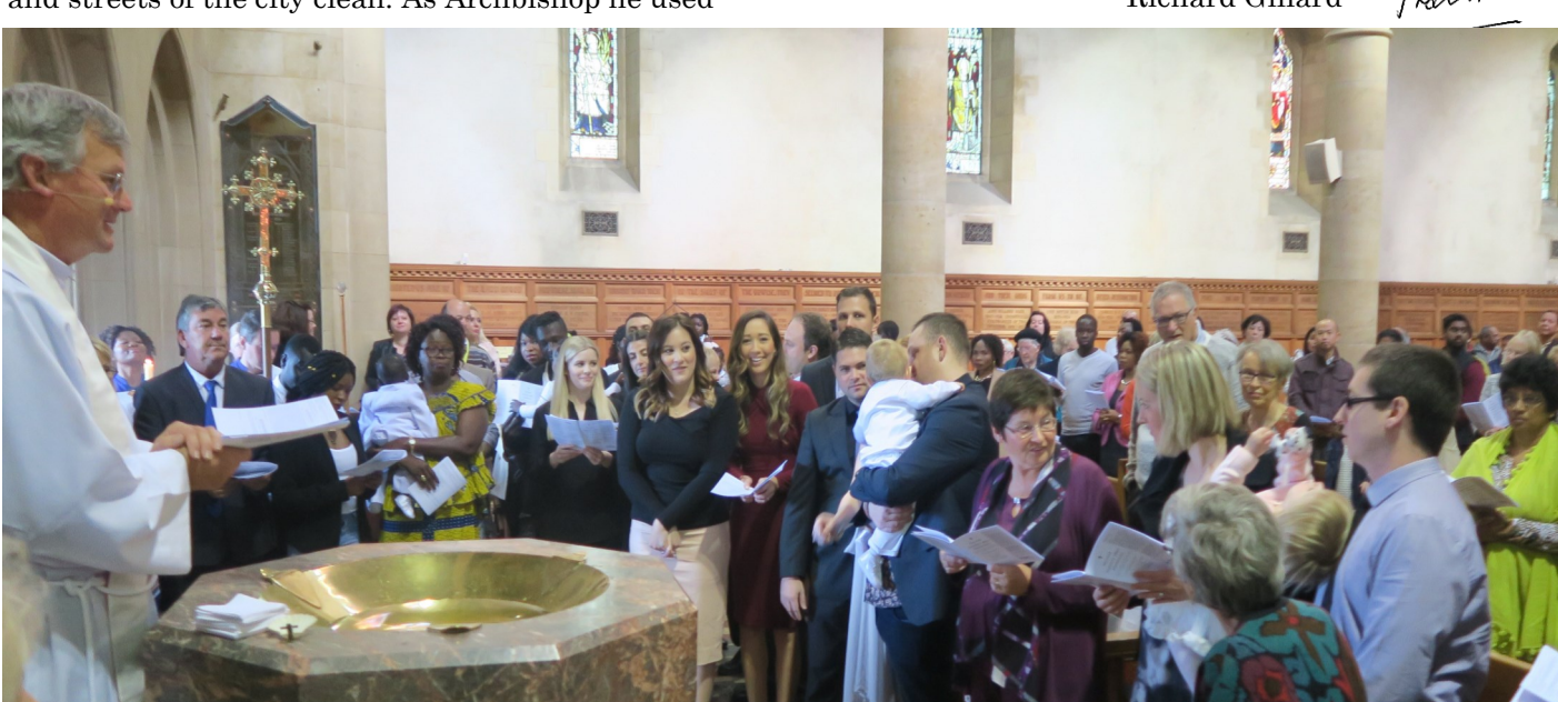
On the last Sunday of May, seven people of various ages were baptised into the family of the Servant King.